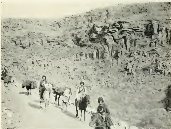
OUR ESCORT AND LUGGAGE